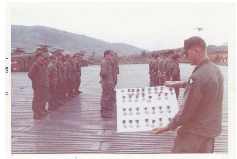
1 Silver Star 7 DFC 22 Air Medals with V for Valor