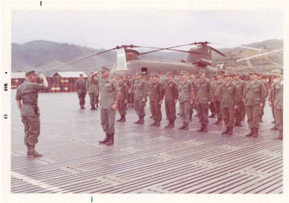
LTG Stilwell, XXIV Corp Commander 159th ASHB 101st Airmobile