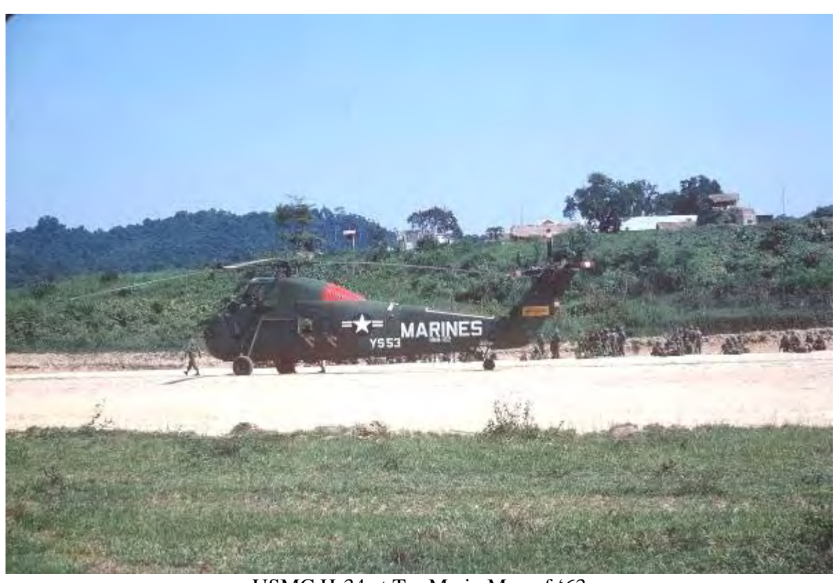
USMC H-34 at Tra My in May of '63