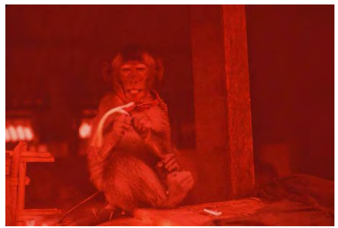
Sylvester the monkey