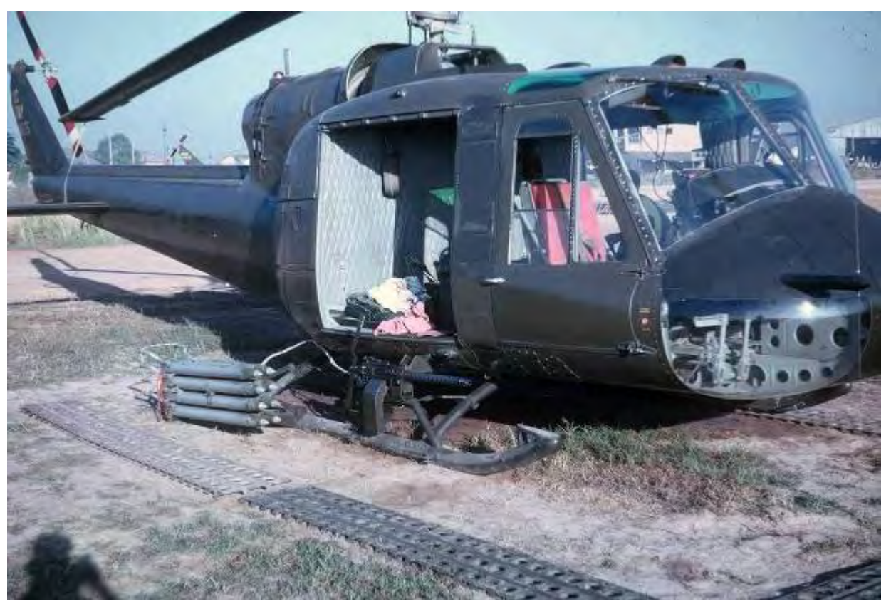
HU-1A with rockets and M-38, .30 cal. MG all installed by the UTT