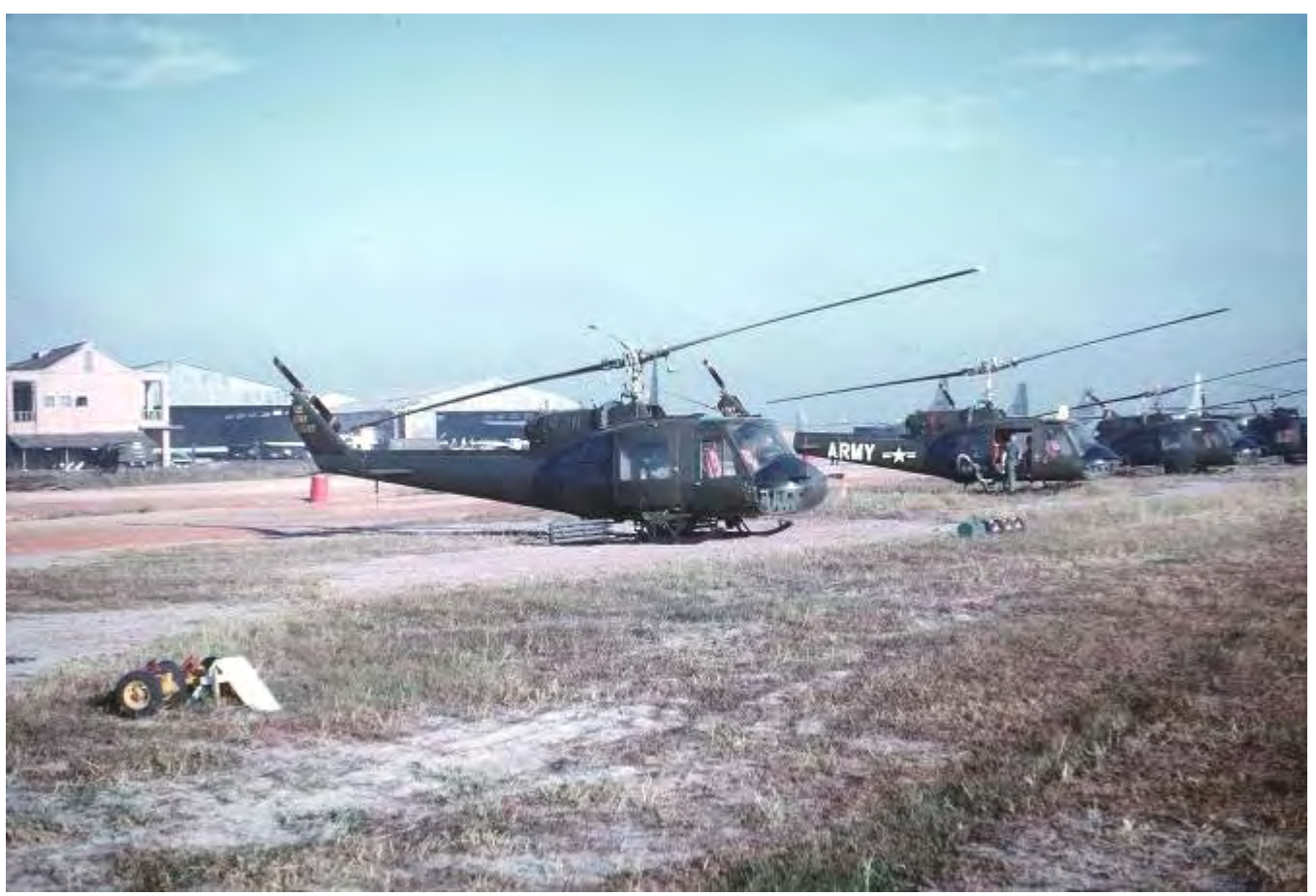
UTT flight line with HU-1A's & HU-1B's at Tan Son Nhut Airport