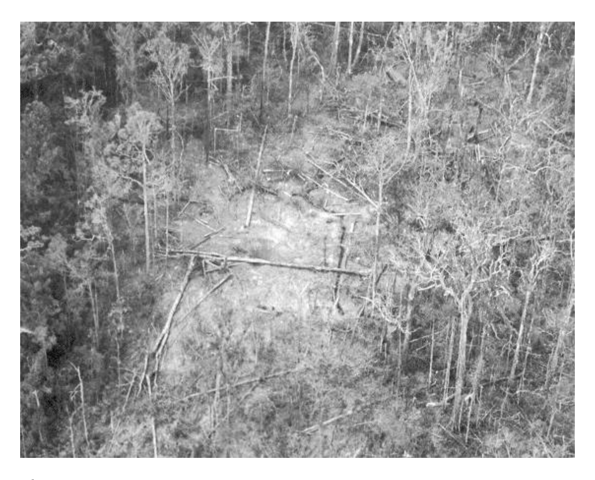
The LRRP insertion...

Ivy 33 was the call sign of the LRRP and the helicopter call sign was Black Jack 241. On this mission, we had a C&C (Command and Control) overhead at about 2-3000 feet with the call sign of Black Jack 6.