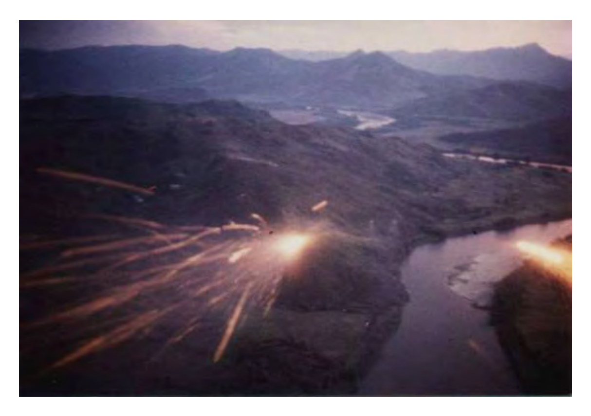
Welcome to the war!