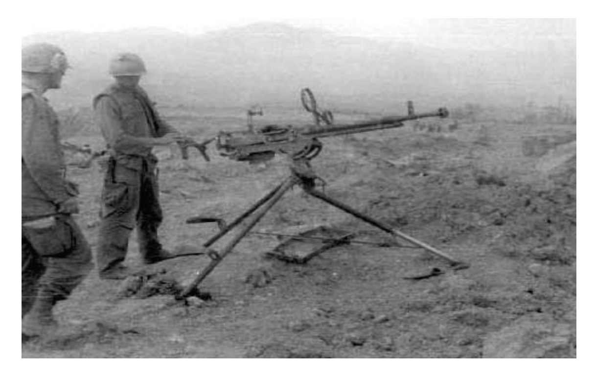
51 cal. Chicom Machine Gun

After an encounter with one of these guns I would shake violently from the adrenaline surge in my blood. As I close my eyes now, over 35 years later, I can hear their distinctive sound and the hair stands up on the back of my neck!