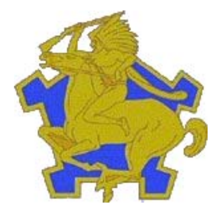
We Can, We Will