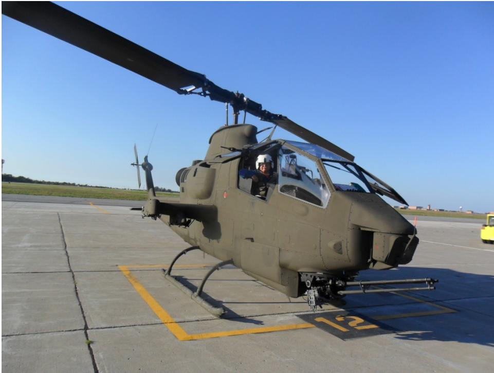
68-17108, MTF complete. Wheeler-Sack AAF, Fort Drum, NY August 2011.