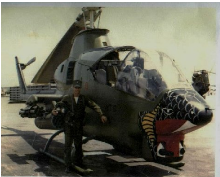
Scarface 22, Marble Mountain, Vietnam 1970.

Here is the story of 68-17108. 108 came off the Bell line in Hurst in January 1970 and was accepted by the US Army. It left Hurst and went to Fort Hood where it joined a group of AH-1G's being "loaned" to the Marine Corps. She was assigned to HML-367 and began flying combat operations in support of Marine units in I Corps Vietnam and the occasional cross border mission. 108 finished its combat tour and transferred the new USMC Cobra squadron, HMA-169, at Camp Pendleton, CA. In 1972, 108 went to Corpus Christi Army Depot for overhaul. After CCAD, 108 stayed with the USMC at Camp Pendleton until being transferred to the Defense Aircraft storage facility at Davis-Moahan AFB,(the bone yard), in April 1979. It was transferred to the Bell Helicopter facility in Amarillo in 1981 and in February 1982 68-17108 rejoined the US Army as an AH-1F. She soldiered on with the 1 st Armored Division in Germany and after a facelift in 1988 at CCAD, went to Korea. She came back to the states in 1994 and the Army National Guard. Then in September 2001 68-17108 went to Fort Drum and long term storage.